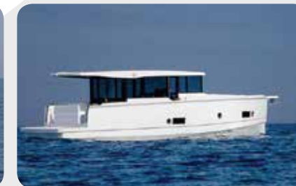
Seafaring Yachts 44