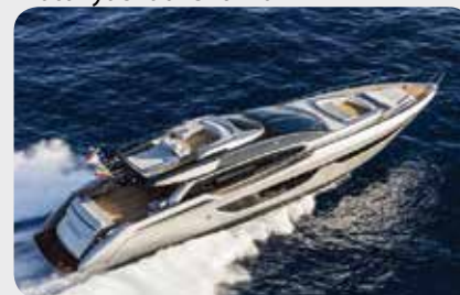
Riva 76 Perseo