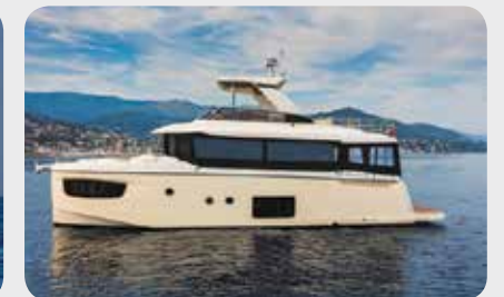
Absolute Navetta 52