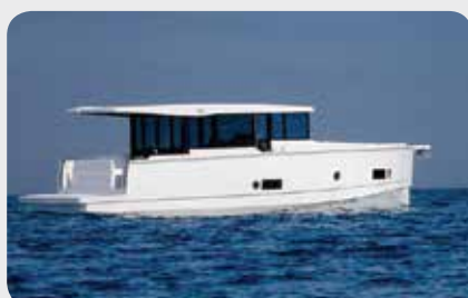
Seafaring Yachts 44

ADRIATIC PRODUCT OF THE YEAR the motorboat or sailing boat manufactured in the Adriatic region (ITA, SLO, CRO, MN)