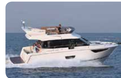
Jeanneau Velasco 37 F