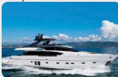
Sanlorenzo SL 86