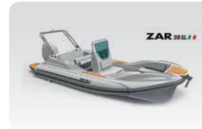
ZAR 59 SL