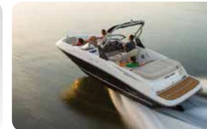
Bayliner VR 5