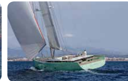
Brenta 80 DC