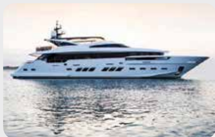
Dreamline DL34 M